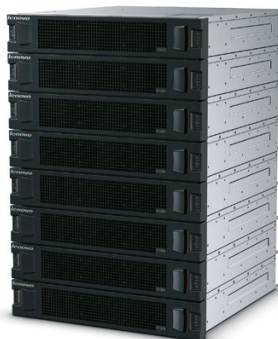
The Lenovo Storage S3200 controller unit with seven E1024 expansion units delivers a total of 192 drives.