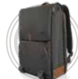
Lenovo 15.6" Laptop Urban Backpack B810