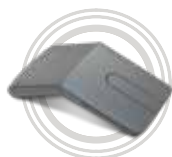
Lenovo Yoga Mouse with Laser Presenter