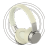
Lenovo Yoga Active Noise-cancellation Headphones