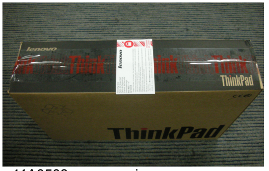
41A0508 over opening

2.3.2.3 Tuck Carton Sealing Instructions