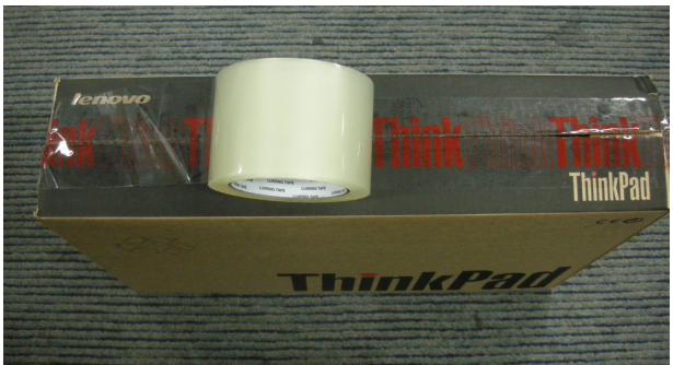
Clear, unprinted tape over previous taping

2.3.2.3 Tuck Carton Sealing Instructions