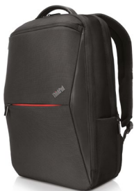
ThinkPad Professional 15.6" Backpack