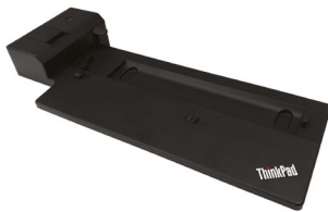
ThinkPad Pro Docking Station