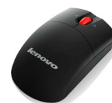
Lenovo Laser Wireless Mouse