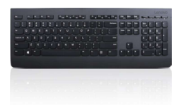
Lenovo Professional Wireless Keyboard

*Based on Google Chrome Power_LoadTest, a battery run down test. For more information about Google Chrome Power_LoadTest, visit www.chromium.org . Test results should be used only to compare one product with another and are not a guarantee you will experience the same battery life. Battery life may be significantly less than the test results and varies depending on your product's configuration, software, usage, operating conditions, power management settings and other factors. Maximum battery life will decrease with time and use.