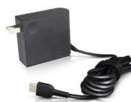
USB-C 45W AC Adapter