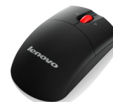
Lenovo Laser Wireless Mouse