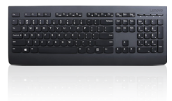
Lenovo Professional Wireless Keyboard

*Based on Google Chrome Power_LoadTest, a battery run down test. For more information about Google Chrome Power_LoadTest, visit www.chromium.org . Test results should be used only to compare one product with another and are not a guarantee you will experience the same battery life. Battery life may be significantly less than the test results and varies depending on your product's configuration, software, usage, operating conditions, power management settings and other factors. Maximum battery life will decrease with time and use.