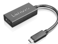
USB-C to HDMI Adapter