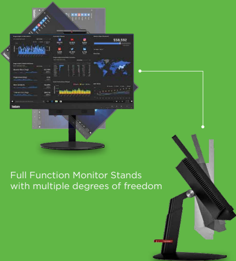
Full Function Monitor Stands with multiple degrees of freedom