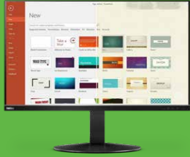
TÜV Eye Comfort certified ThinkVision P32u-10 Monitor