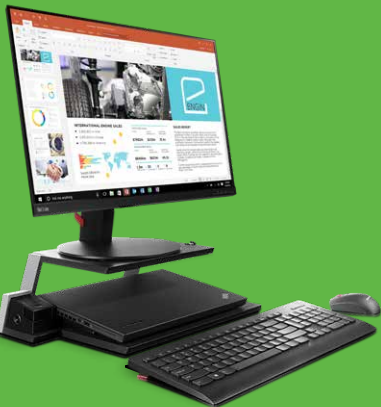
Dual Platform Notebook Stand with ThinkPad laptop and ThinkVision monitor