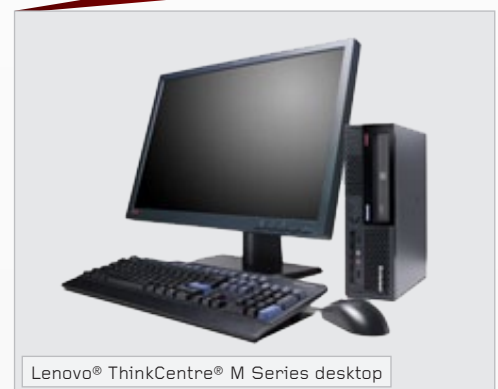
Lenovo® ThinkCentre® M Series desktop