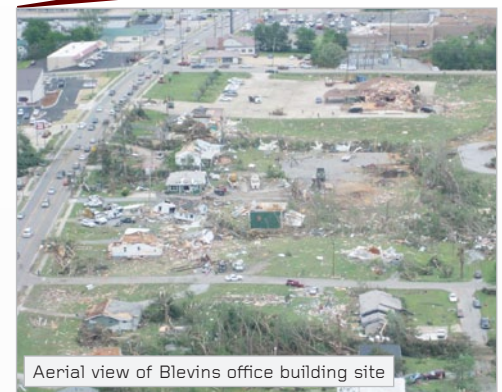
Aerial view of Blevins office building site