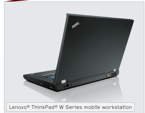
Lenovo® ThinkPad® W Series mobile workstation

"We wanted to centralize our data to create more efficient processes."