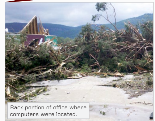
Back portion of office where computers were located.

ASIA: Singapore: 800 6011 389 (ext: 9006, 9007, 9029), Malaysia: 1 800 880 247 (ext: 9005, 9010, 9039) Indonesia: 1803 60 6292 (ext. 9013, 9106, 9115) 62-21-300 210 000, Thailand: Toll Free 1800 060 129 or (02-6896484) (ext: 9002, 9016, 9018, 9020), Philippines: 1800 1601 0035 (ext. 9014, 9015), Vietnam: 84 83 8243504 ext 111