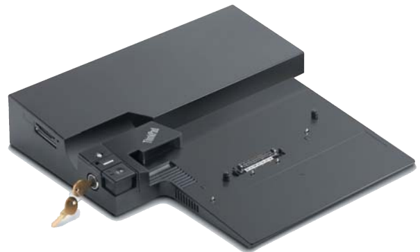
ThinkPad Advanced Dock 250310U