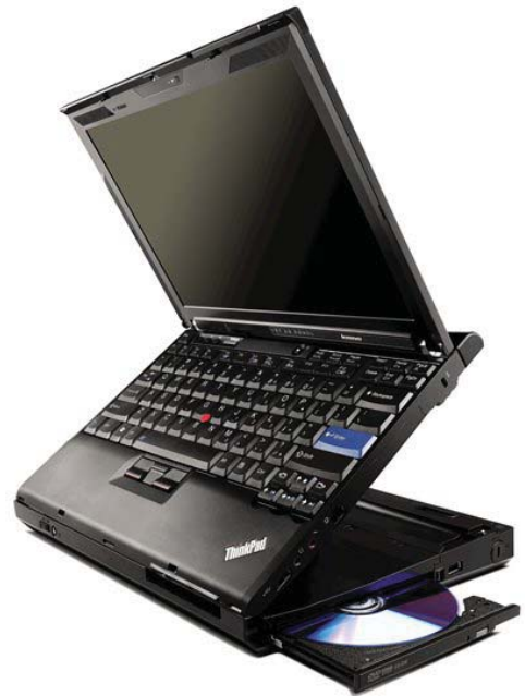
Lenovo ThinkPad X200 with ThinkPad X200 UltraBase 43R8781