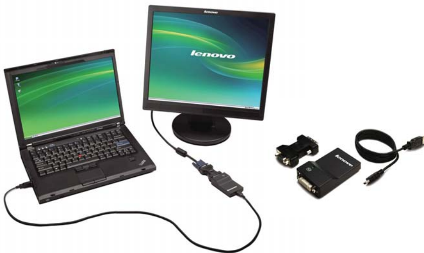
Lenovo USB-to-DVI Monitor Adapter 45K5296