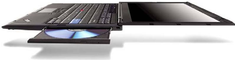
Lenovo ThinkPad X301