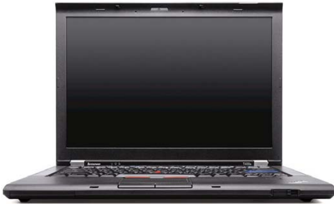
Lenovo® ThinkPad T400s