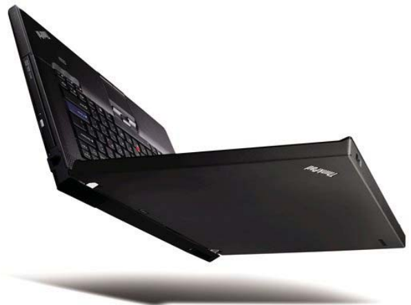
Lenovo ThinkPad W500