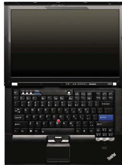
Lenovo ThinkPad R400