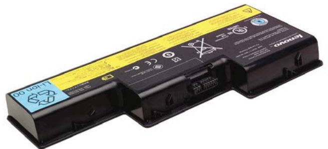
W700 Series Li-Ion Battery 9-cell 45J7914