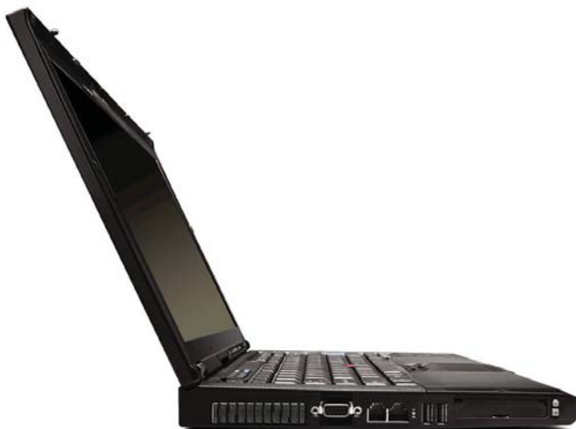
Lenovo ThinkPad R400