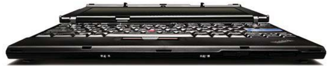
Lenovo ThinkPad X200s