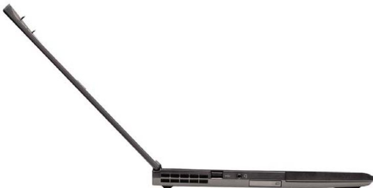
Lenovo ThinkPad T400s