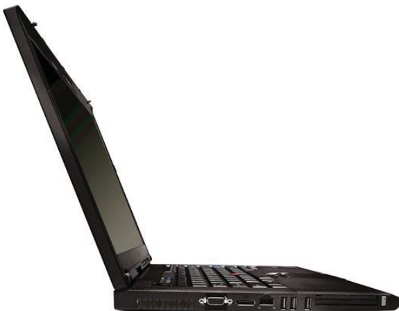
Lenovo ThinkPad T500