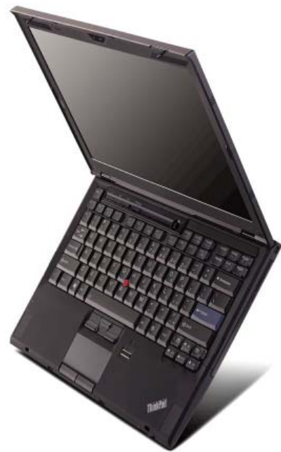
Lenovo ThinkPad X301