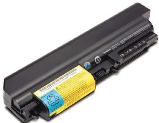
T/R 14W High Capacity Battery 9-cell 43R2499