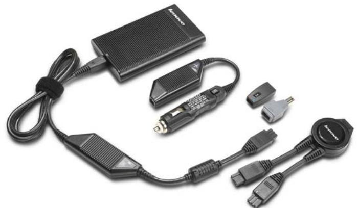
90W Ultraslim AC/DC Combo Adapter 41R4493