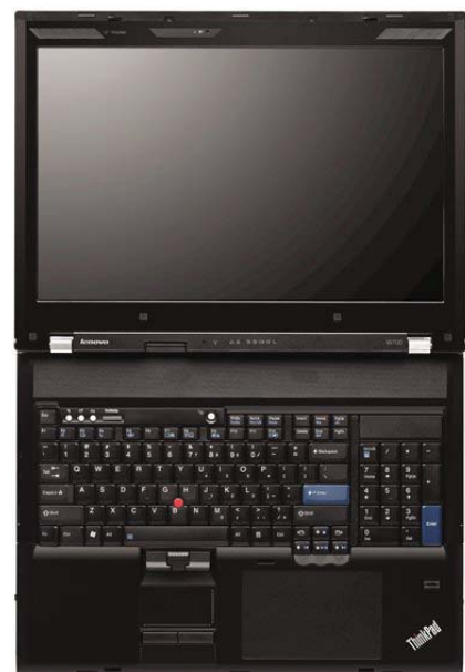
Lenovo ThinkPad W700