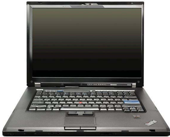
Lenovo® ThinkPad W500