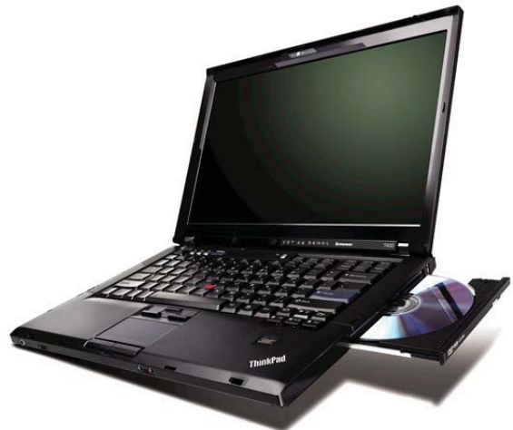
Lenovo ThinkPad T400