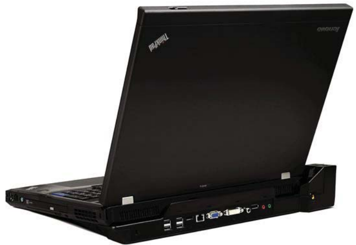
Lenovo ThinkPad W700 with ThinkPad W700 Mini Dock 2.0 57Y4345