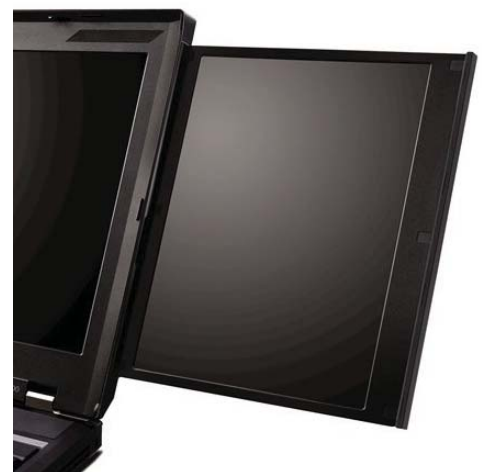
Lenovo ThinkPad W700ds