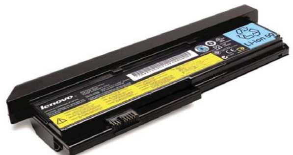
X200 Series Li-Ion Battery 9-cell 43R9255