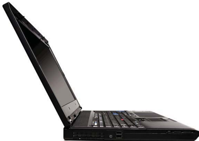
Lenovo ThinkPad W700