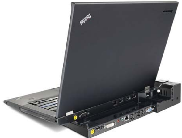
Lenovo ThinkPad T400s with ThinkPad Mini Dock Series 3 433710U