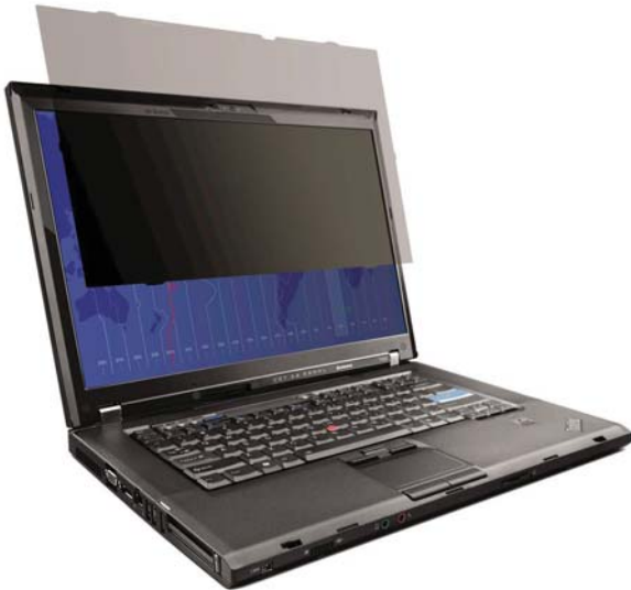
Lenovo ThinkPad T500 with T500/R500/W500 Series 15W Privacy Filter 43R2474