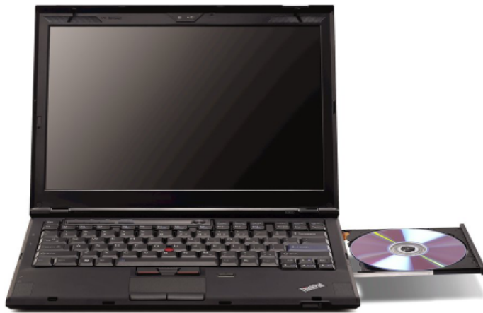
Lenovo® ThinkPad X301