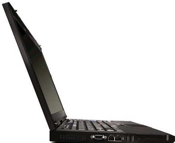
Lenovo ThinkPad T400