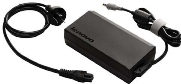
ThinkPad 170W AC Adapter 41R4421