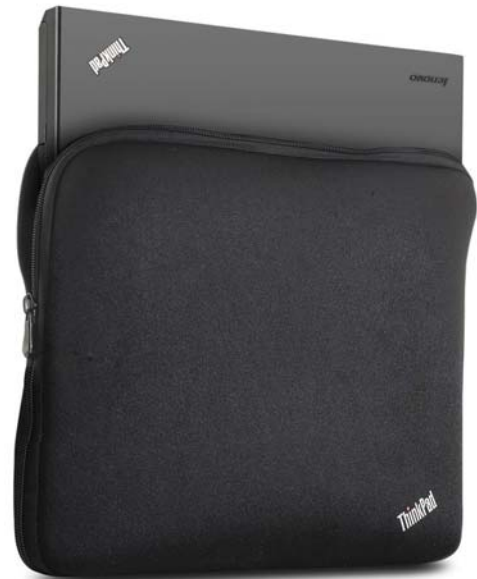
ThinkPad 12W Case Sleeve 51J0476