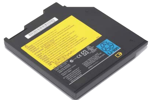
Advanced Ultrabay Battery III 57Y4536