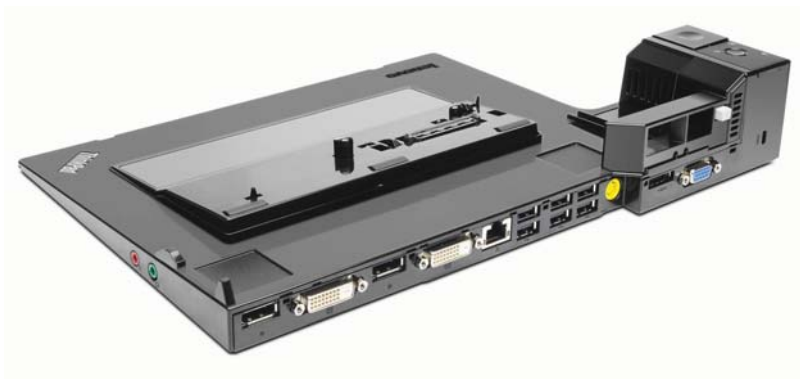
ThinkPad Mini Dock Plus Series 3 433810U