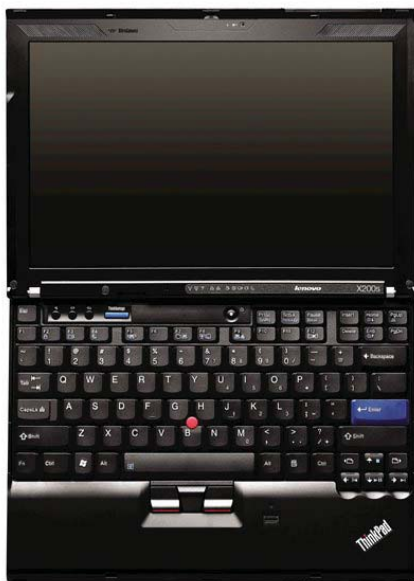
Lenovo ThinkPad X200s