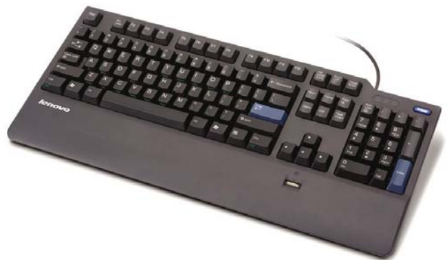
Lenovo USB Fingerprint Keyboard 73P4730