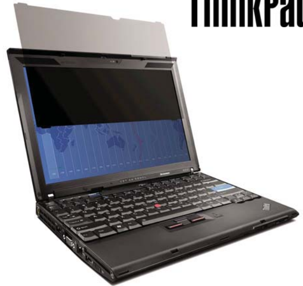
Lenovo ThinkPad X200 with X200/X200s (WXGA) 12W Privacy Filter 55Y9264