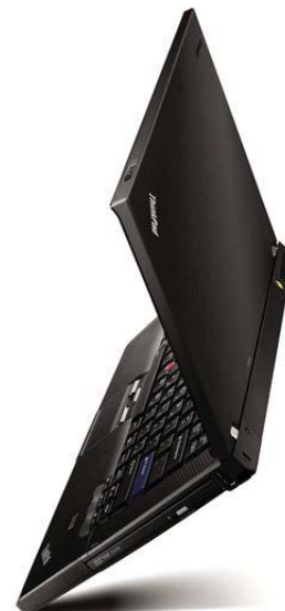
Lenovo ThinkPad T400