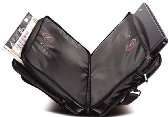
ThinkPad Checkpoint Friendly Business Topload Case 51J0418