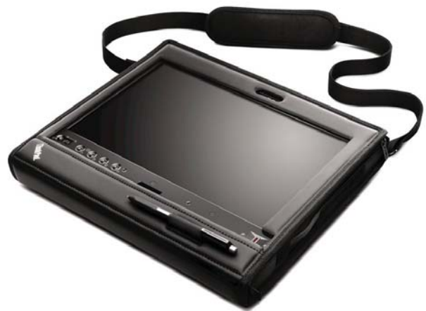
Lenovo ThinkPad X200 with ThinkPad X200 Tablet Sleeve 43R9115