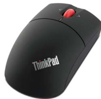
ThinkPad Bluetooth Laser Mouse 41U5008