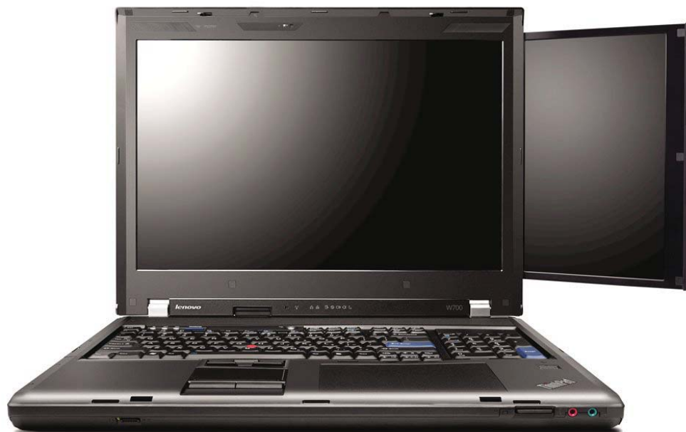
Lenovo ThinkPad W700ds