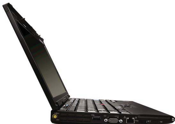
Lenovo ThinkPad X200s