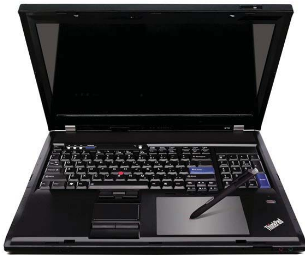
Lenovo® ThinkPad W700