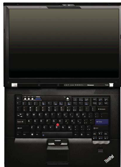
Lenovo ThinkPad W500