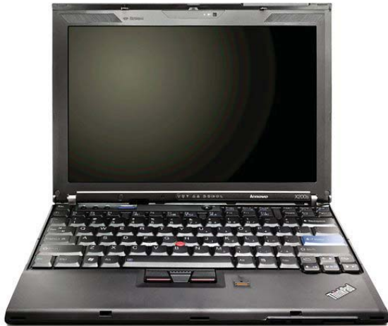
Lenovo® ThinkPad X200s