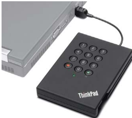
USB 2.0 Portable Secure Hard Disk 160GB 43R2018 320GB 43R2019