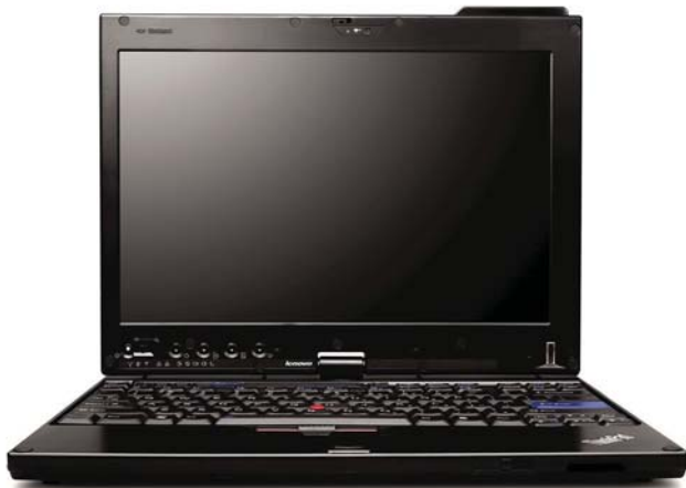
Lenovo® ThinkPad X200 Tablet