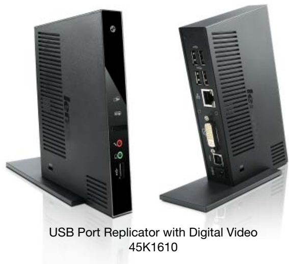
USB Port Replicator with Digital Video 45K1610