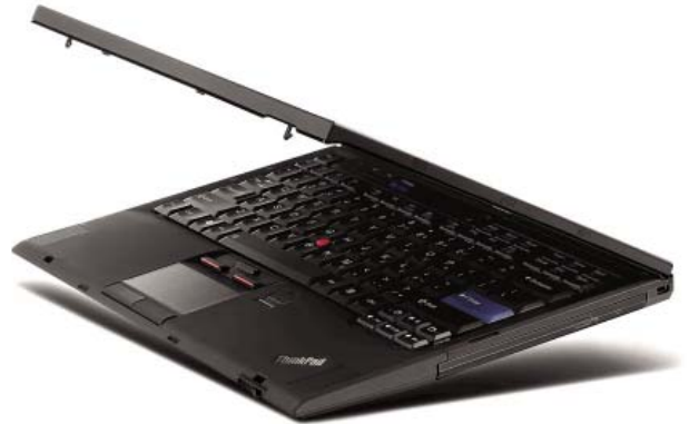
Lenovo ThinkPad X301