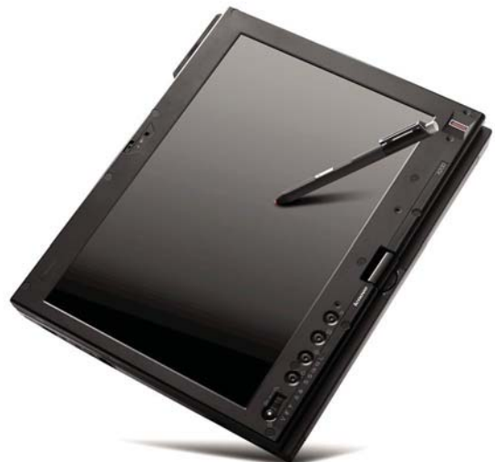
Lenovo ThinkPad X200 Tablet