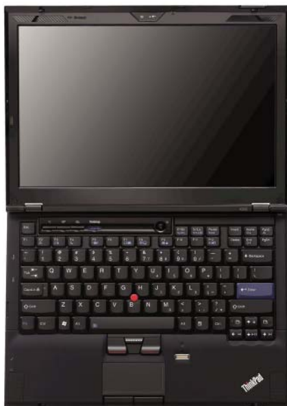
Lenovo ThinkPad X301