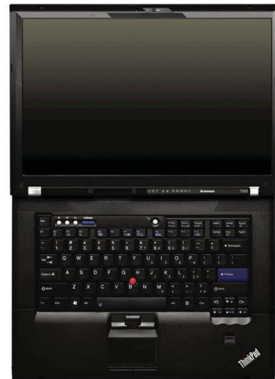
Lenovo ThinkPad T500