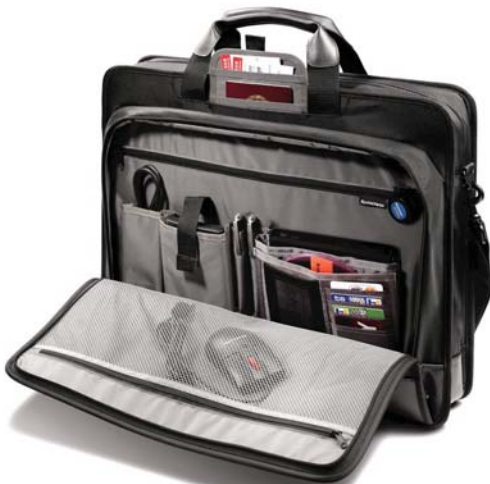
ThinkPad 17W Business Topload Case 43R9117