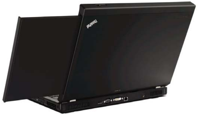
Lenovo ThinkPad W700ds