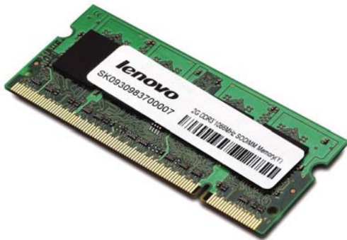
PC3-8500 DDR3 Low-Halogen SODIMM 1GB 55Y3706 2GB 55Y3707