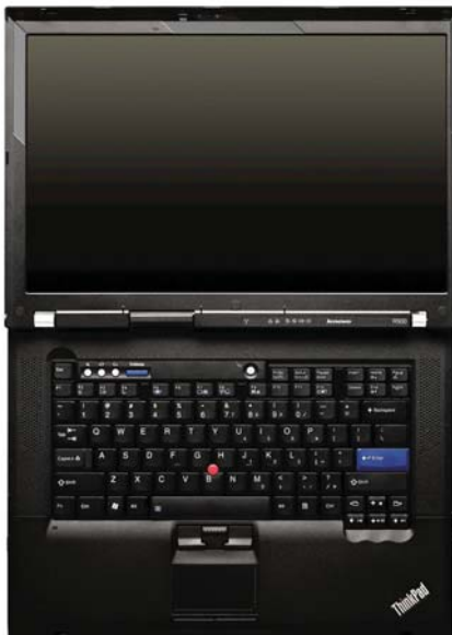
Lenovo ThinkPad R500