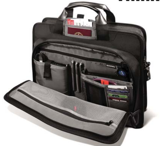
ThinkPad Business Topload Case 43R2476