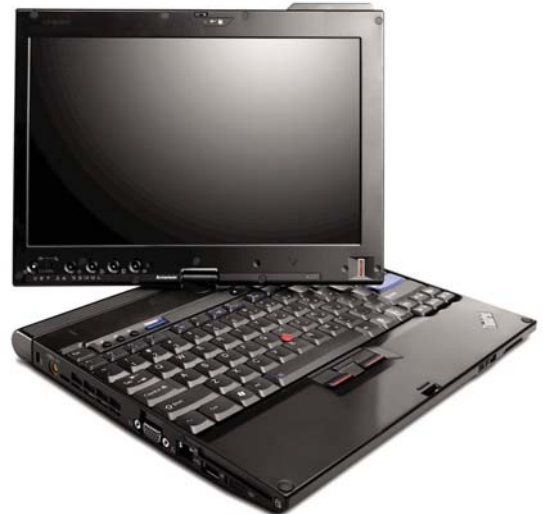
Lenovo ThinkPad X200 Tablet