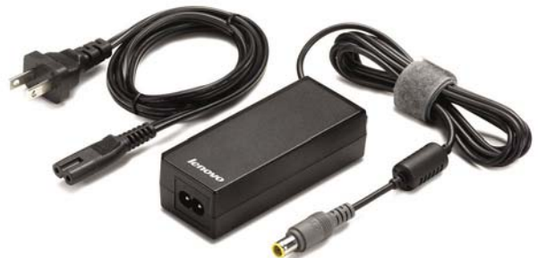
ThinkPad 65W AC Adapter 40Y7696