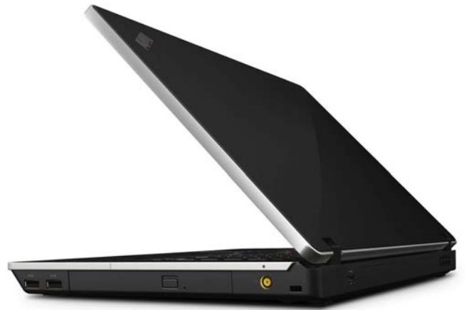
Lenovo ThinkPad Edge 15" (Glossy black model)