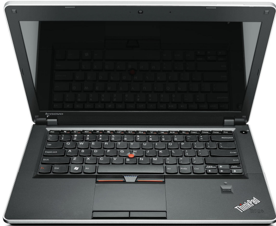
Lenovo® ThinkPad Edge 14"