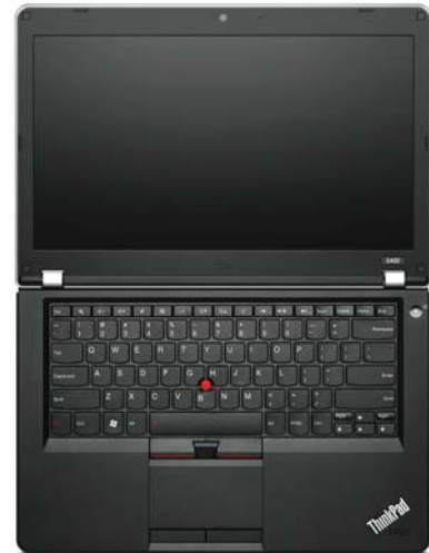
Lenovo ThinkPad Edge E420