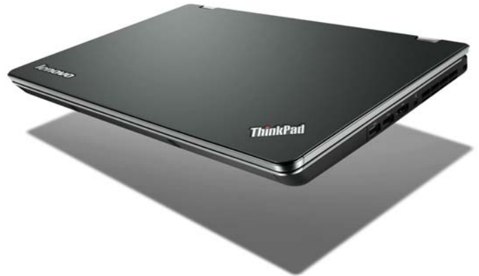
Lenovo ThinkPad Edge E420s