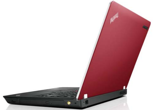
Lenovo ThinkPad Edge E420