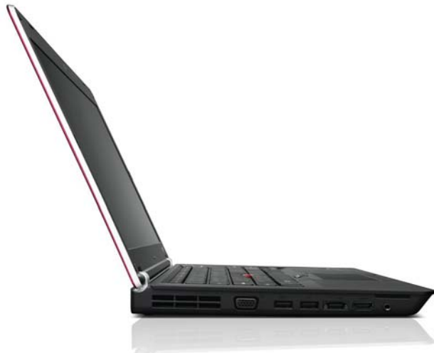
Lenovo ThinkPad Edge E420