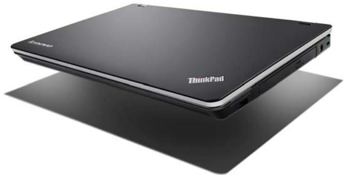
Lenovo ThinkPad Edge E520