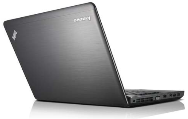
Lenovo ThinkPad Edge E530