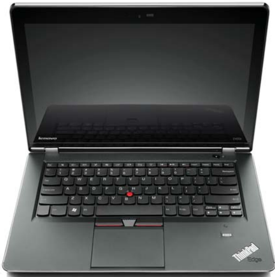
Lenovo® ThinkPad Edge E420s