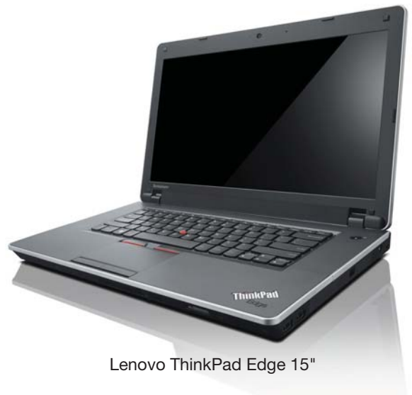
Lenovo ThinkPad Edge 15"