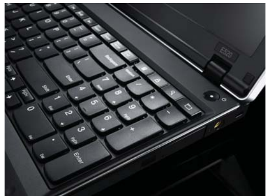
Lenovo ThinkPad Edge E520