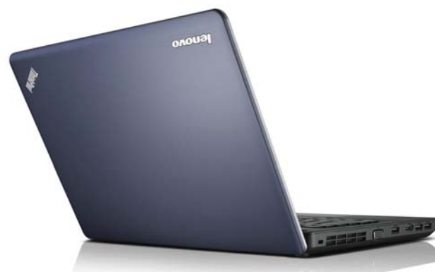
Lenovo ThinkPad Edge E430