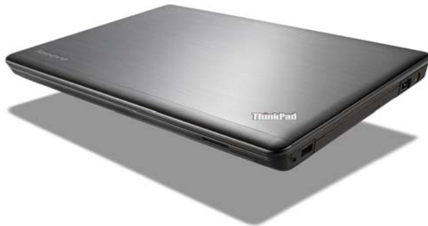
Lenovo® ThinkPad Edge E530