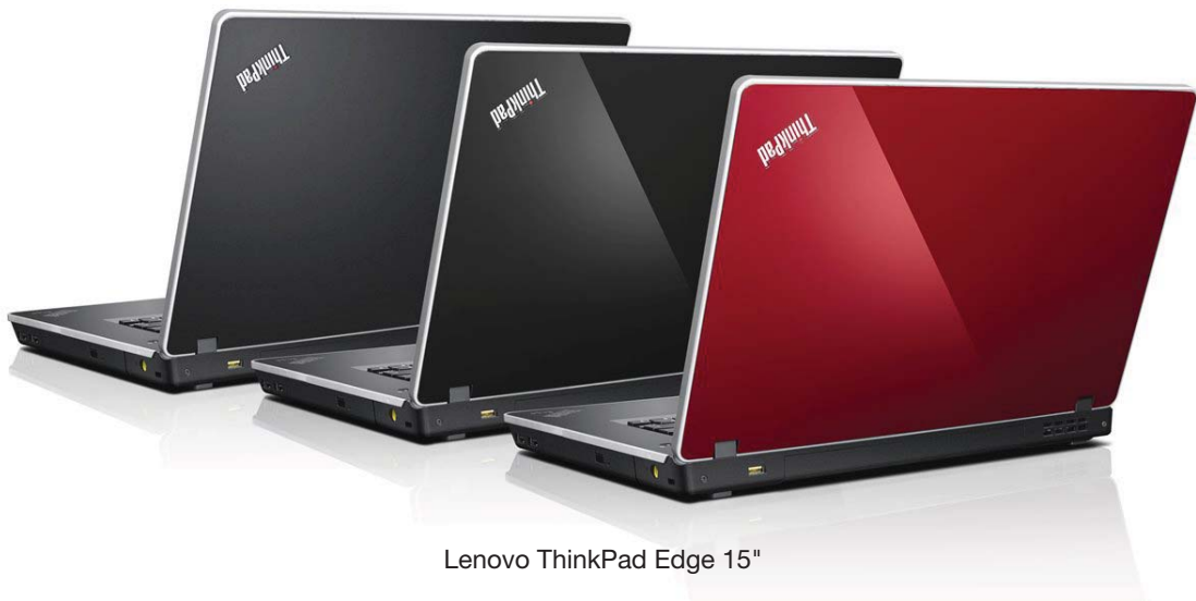
Lenovo ThinkPad Edge 15"