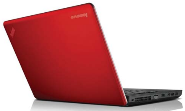
Lenovo ThinkPad Edge E530