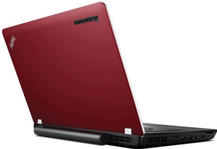
Lenovo ThinkPad Edge E420