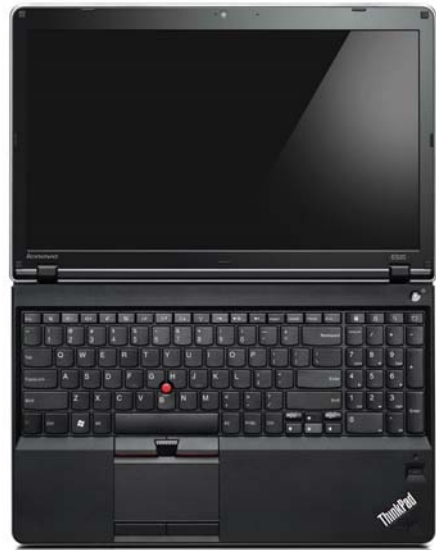
Lenovo ThinkPad Edge E520