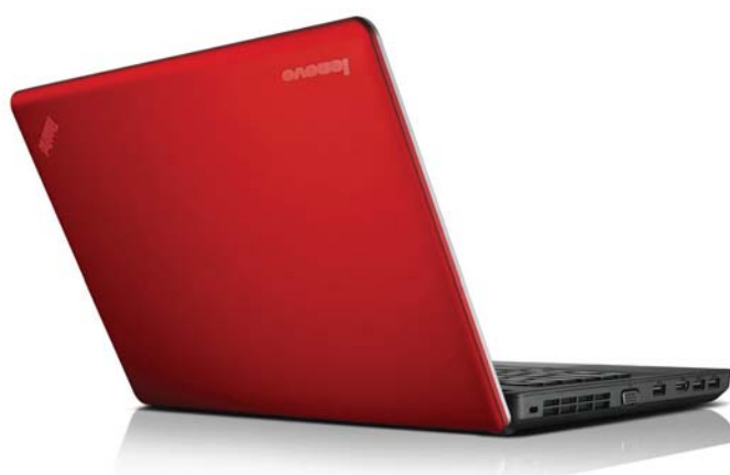
Lenovo ThinkPad Edge E430