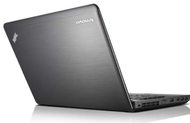
Lenovo ThinkPad Edge E430