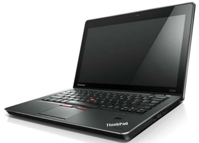
Lenovo ThinkPad Edge E220s