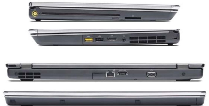
Lenovo ThinkPad Edge E420s