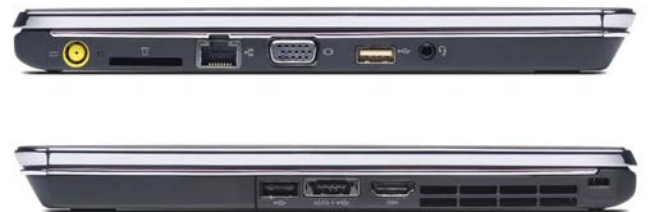
Lenovo ThinkPad Edge E220s