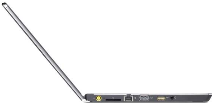
Lenovo ThinkPad Edge E220s