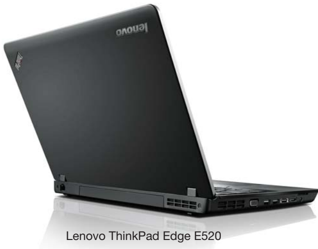
Lenovo ThinkPad Edge E520