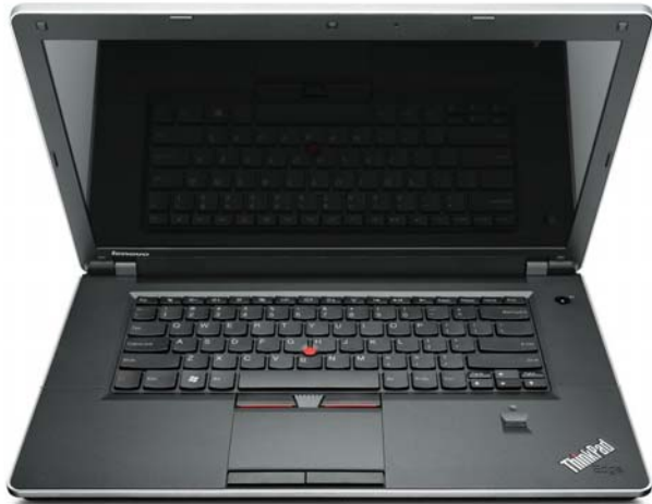
Lenovo® ThinkPad Edge 15"