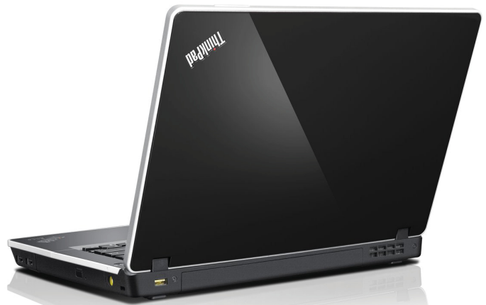
Lenovo ThinkPad Edge 14" (Glossy black model)