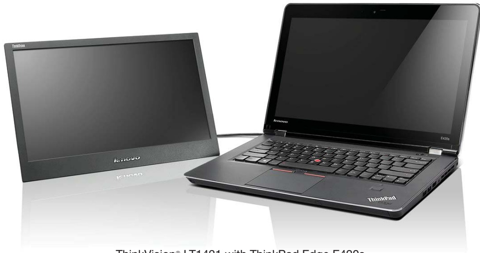
ThinkVision® LT1421 with ThinkPad Edge E420s