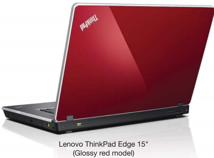
Lenovo ThinkPad Edge 15" (Glossy red model)