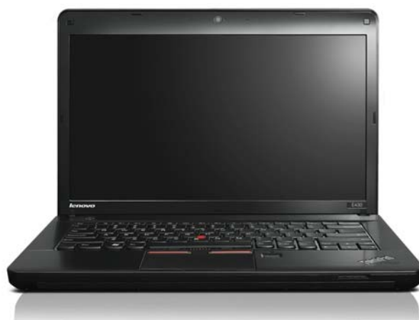
Lenovo ThinkPad Edge E430