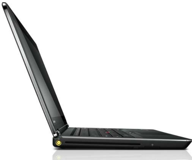
Lenovo ThinkPad Edge E420s