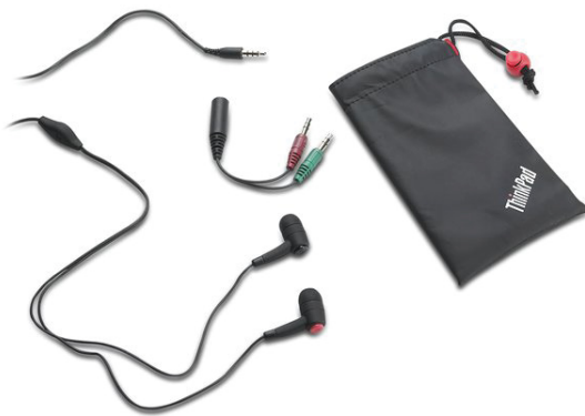
ThinkPad In-Ear Headphones with mic 57Y4488