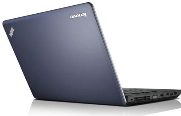
Lenovo ThinkPad Edge E530