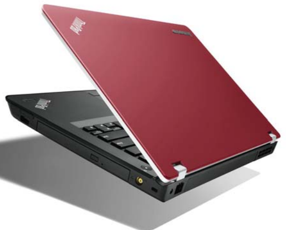
Lenovo ThinkPad Edge E420