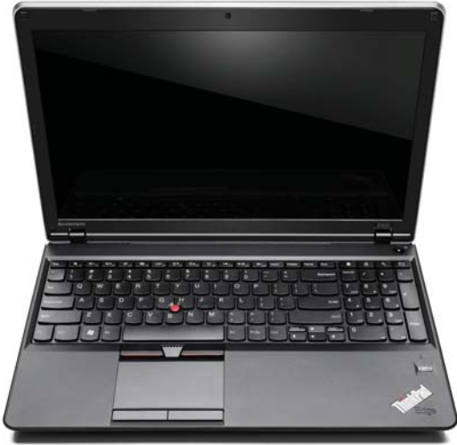
Lenovo® ThinkPad Edge E520