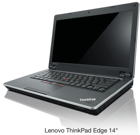
Lenovo ThinkPad Edge 14"