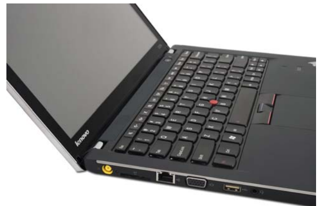
Lenovo ThinkPad Edge E220s