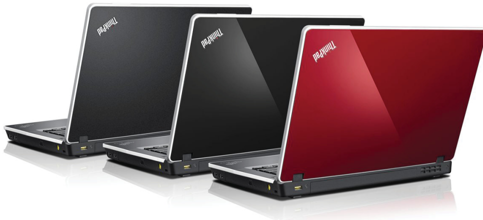
Lenovo ThinkPad Edge 14"