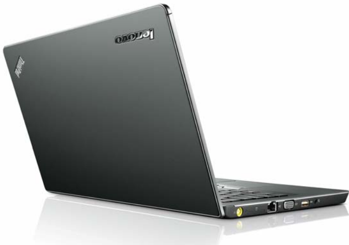
Lenovo® ThinkPad Edge E220s