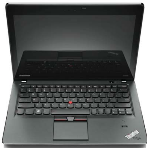
Lenovo ThinkPad Edge E220s