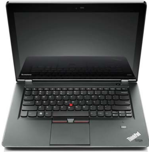
Lenovo® ThinkPad Edge E420