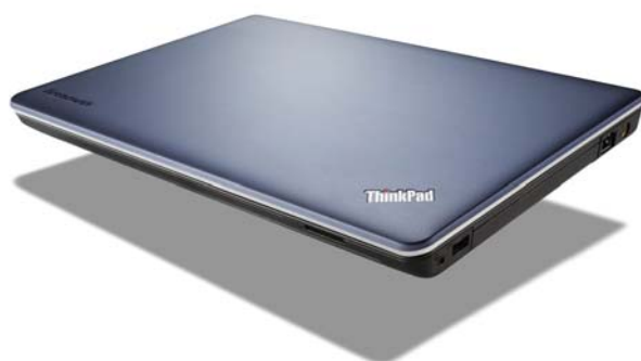
Lenovo ThinkPad Edge E430