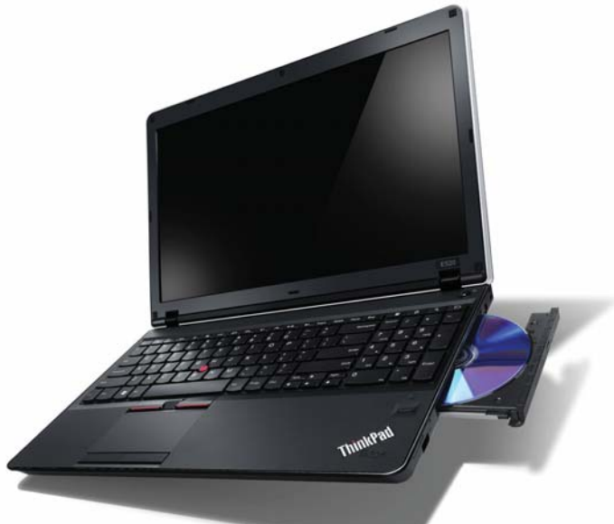
Lenovo ThinkPad Edge E520