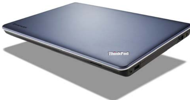
Lenovo ThinkPad Edge E530