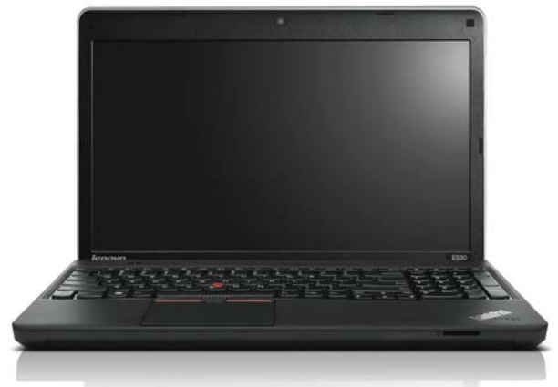
Lenovo ThinkPad Edge E530