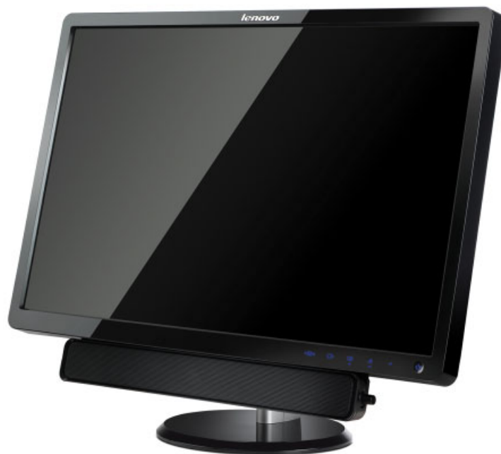
Lenovo L222 Wide Monitor

Visit www.lenovo.com/psref for the latest version