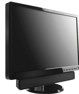
Lenovo L195 Wide