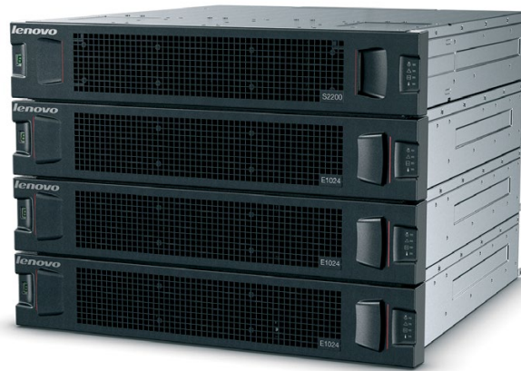
The Lenovo Storage S2200 controller unit with three E1024 expansion units delivers a total of 96 drives.